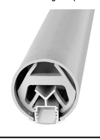
XTRU-RAIL Linear Series Aluminum LED lighted profile.

Please note: These profiles are only compatible with strip light 0.4 inches wide or smaller. They are compatible with ThinGlow LED Strip Light.